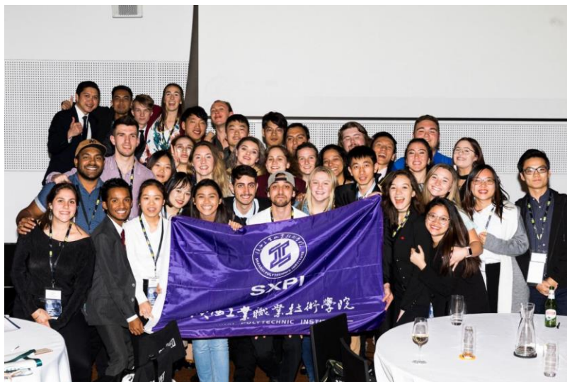
The 2018 Young Leaders pictured in Melbourne.

Students from Australia, Chile, Brazil, USA, Canada, New Zealand, Malaysia, Singapore, China and Hong Kong took part in the four-day Young Leaders Camp, held at the Lilydale Campus of Box Hill Institute. In the WFCP's first accredited youth camp, the young leaders considered the challenges to PTET sector and counselled leaders of PTET to #breakthebox in education.