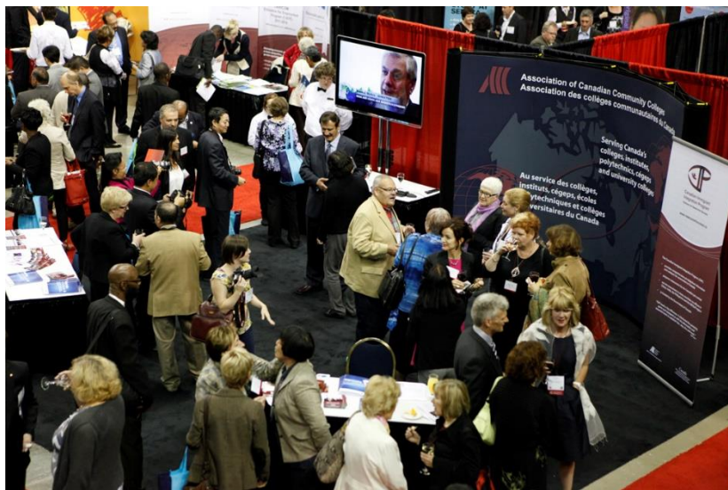
The 2012 World Congress in Halifax, Canada.

The WFCP began as an informal network borne out of a desire to have a forum for the almost 4,000 professional and technical education and training institutions around the world to meet regularly, learn from each other, and share experiences. The first meeting was held in 1999 in Quebec City, Canada along with the first World Congress of the WFCP. The Federation officially formalized as a network in 2002 with the 2 nd World Congress held in Melbourne, Australia.