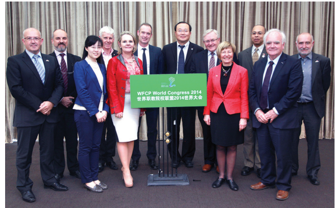
Board of Directors at the World Congress 2014 in Beijing

Foster global citizenship: in an increasingly open and internationalized world, institutes will intensify efforts to further develop international co-operation and to allow their students to prepare for an international citizenship that entails social responsibility, a global vision, professional skills and innovative solutions.