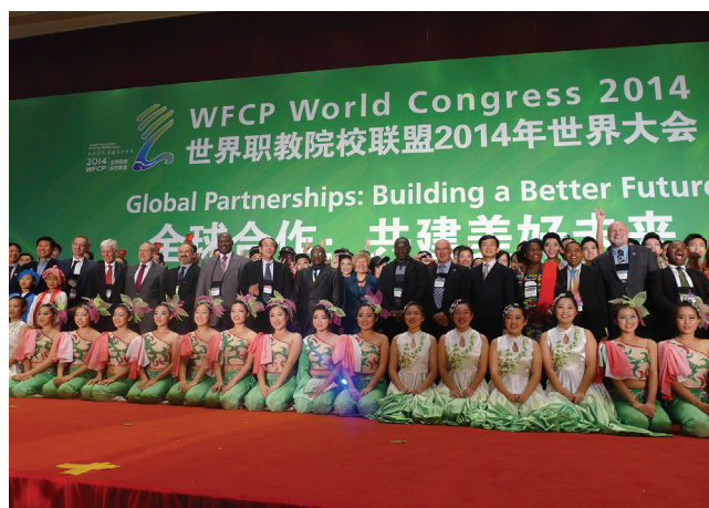
WFCP World Congress 2014 in Beijing, China

The 2012 World Congress was held in Halifax, Nova Scotia, Canada and hosted by Association of Canadian Community Colleges (ACCC), now Colleges and Institutes Canada (CICan). The 2012 Congress provided members and delegates from all over the world with the opportunity to present the latest trends in the higher applied education sector, showcase the research, ideas and innovation that are strengthening applied education, present the realities of our sector in a global context, and bond with colleagues and partners who share an interest in the college and polytechnics sector.