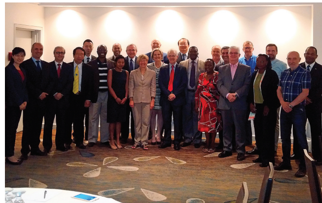
Annual General Meeting - 2015

As seen in section V, the Affinity Groups have steadily grown and become a hallmark of the Federation's commitment to improve dialogue and cooperation between the world's colleges, institutes and polytechnics. The groups have been effective at exchanging and discussing best practices, engaging in research and innovative developments. As noted above, two of the groups have started to engage in discussions about international mobility and exchanges between faculty and students and accreditation.