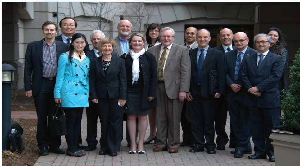
WFCP Board Members gather for their annual meeting in Washington, D.C., USA.

The Government's reform plan is in swing as local governments have been directed to "professionalize" their vocational schools. Vocational institutions are successful at connecting graduates to the labour market, with the Ministry of Education estimating 70% of graduates connect to their employer through their school. Enabling vocational institutions to better accommodate the demands for high quality, skilled workers is a priority for Chinese higher education leaders.