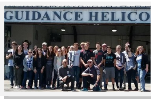
Industry Tour with high school students, April 2016

The symbiotic relationship among the services and analysis generated by the center has created a one-stop shop for 21st century innovation and program design.