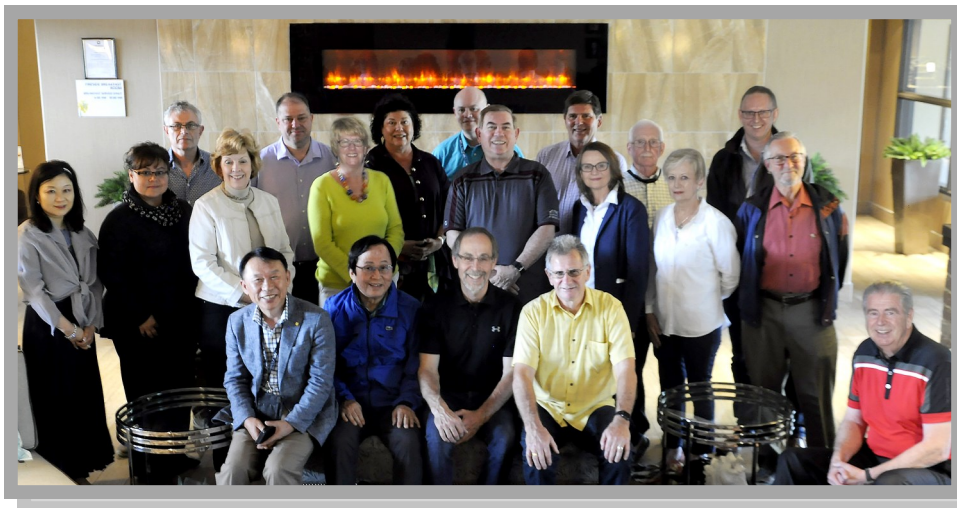
PIN Delegates 2016

Conference delegates were challenged throughout the week to consider the changing landscape of Post Secondary and the role of technological advancements and innovation. With a PIN commitment to foster a close interaction with one another in order to improve and expand the means by which organizations serve their own community, and recognize the community's place in an international setting, the PIN 2016 Executive Leadership Conference at Olds College clearly delivered.