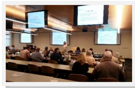
May 2016 Lunch n' Learn - Inventory Management